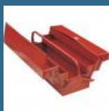
CROMWELL Cutie a extensibila pentru scule 17" 5 TRAY CANTILEVER TOOL BOX