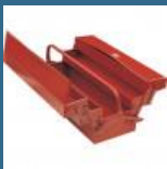
CROMWELL Cutie a extensibila pentru scule 17" 5 TRAY CANTILEVER TOOL BOX