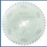
BOSCH Disc Top Precision Best for Wood 315x30x48T