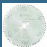
BOSCH Disc Top Precision Best for Wood 315x30x72T