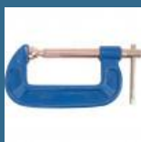
CROMWELL Clama de Uz Extra Intens - Surub Placat cu Cupru 10" EXTRA HEAVY DUTY "G"CLAMP WITH COPPER SCREW