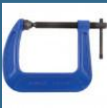
CROMWELL Clama cu Gatul Adanc 4" HEAVY DUTY "G" CLAMP - DEEP THROAT