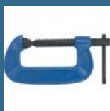
CROMWELL Clama in G 12" EXTRA HEAVY DUTY "G"CLAMP