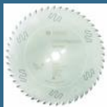
BOSCH Disc Top Precision Best for Wood 315x30x48T