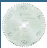
BOSCH Disc Top Precision Best for Wood 315x30x72T