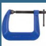
CROMWELL Clama cu Gatul Adanc 4" HEAVY DUTY "G" CLAMP - DEEP THROAT