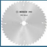
BOSCH Disc Optiline Wood 315x30x48T