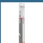
BOSCH S1222VF Set 2 panze Flexible for Wood and Metal 300 mm